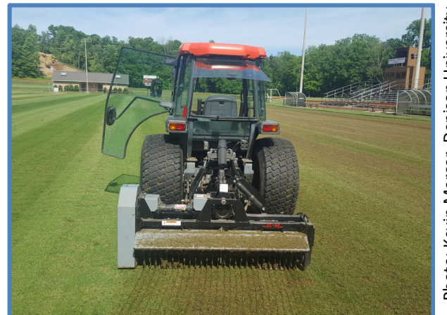
Verticutting of field.

Each June, they aerate 6 inches deep with ¾ inch hollow tines, and apply top dressing and fertilizer. In August, they aerate using ¾ solid tines and then verticut (remove thatch from) the field. Verticutting helps to germinate the perennial ryegrass. It also helps to thicken the Bermuda grass. They top dress again and apply perennial ryegrass and starter fertilizer to encourage the ryegrass to germinate. They also apply fertilizing sprays to the grass.